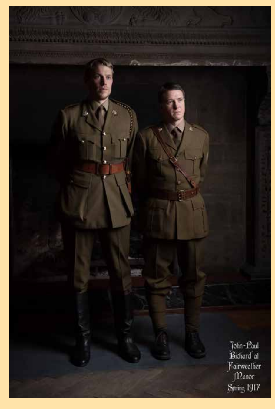
An unknown British World War 1 soldier.