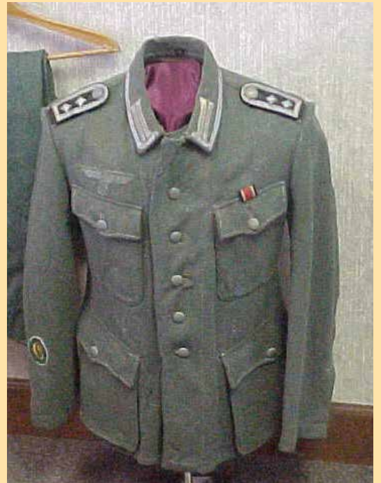
Two Heer NCO uniforms