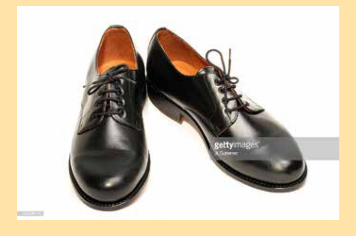
Most times: black shoes will be fine.