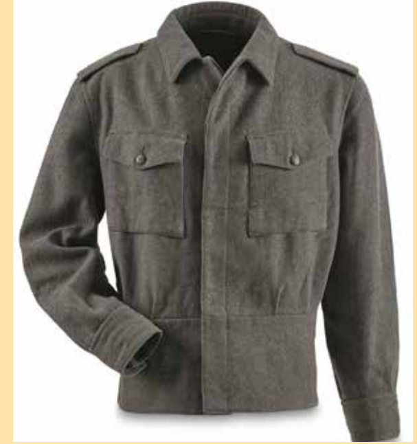
Finnish M65 uniform.