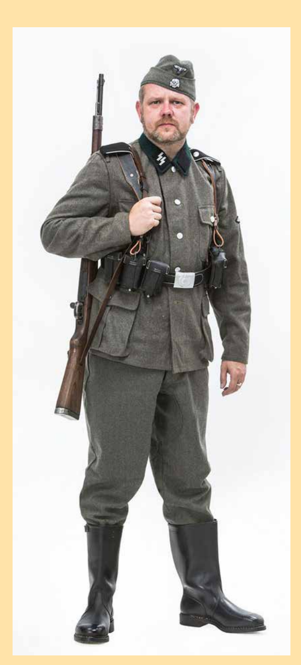
SS private uniform