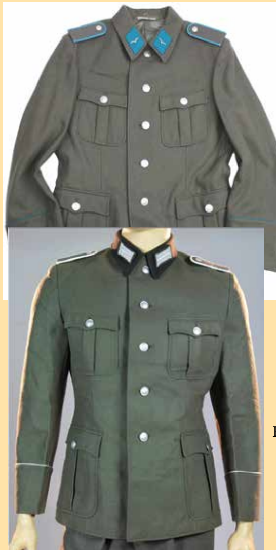
Bundeswehr - luftwaffe

Answer: 50-80's German or other nation uniforms