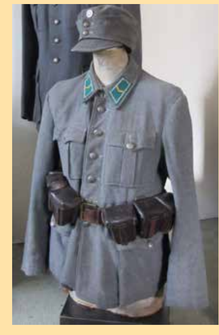
Finnish wartime uniform. (Vintage)