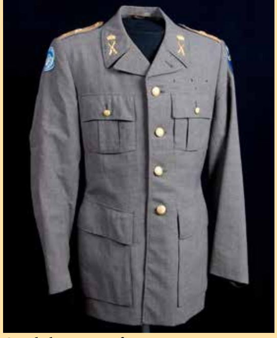
Swedish M52 uniform