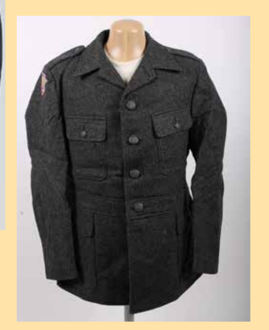
Danish civil defence M55