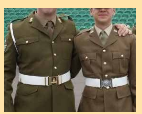
Note: Khaki Green and FAD Brown