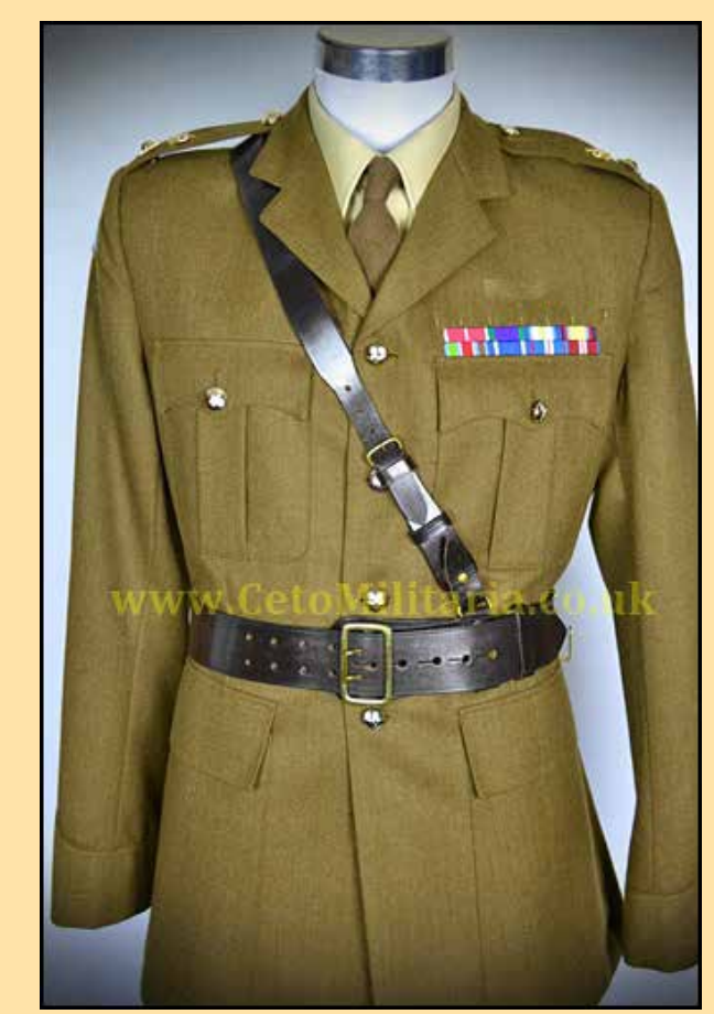
Modern British No.2 Uniform