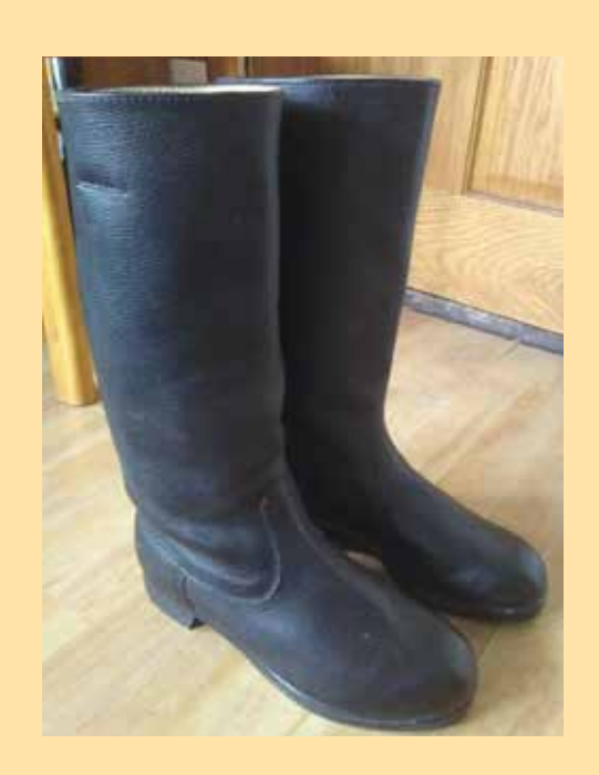
"Modern" military boots, Here DDR Guard boots with metal heel - quite common and cheap.

Black for German - Brown for English. (guideline)