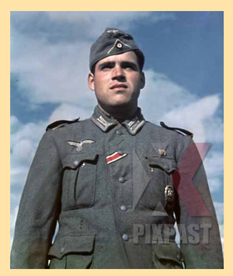
Heer private uniform