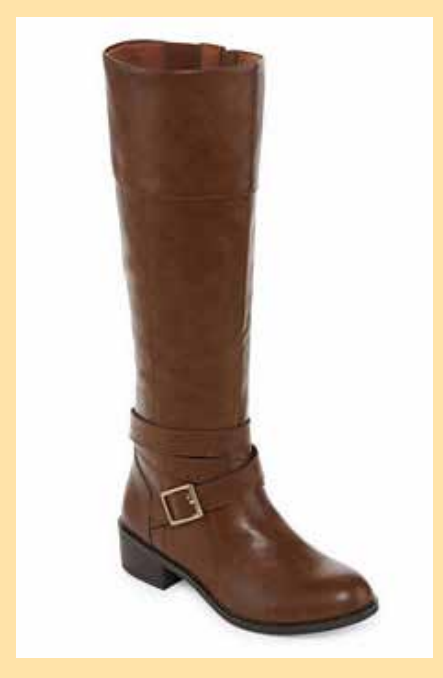
Riding boots Lots of options.